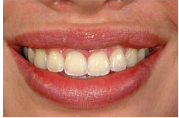
Figure 10: But recovery was possible, after reassessment and placement of brackets to increase incisor display and improvement of the consonance of the smile arc.

is characterized by a flat smile arch, or obliterated buccal corridors.