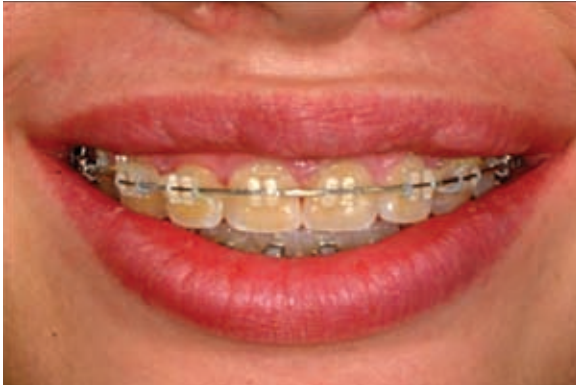
Figure 9: This patient was nearing the end of orthodontic treatment, and her smile arc was somewhat flattened as an unfortunate result of orthodontic treatment.