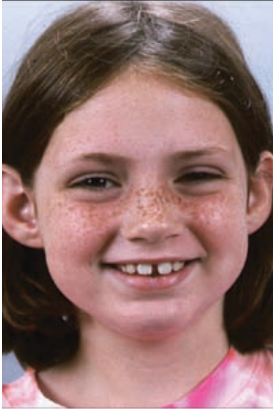
Figure 1: This young patient was first seen for treatment of the maxillary midline diastema. Her clinical exam demonstrated a flat smile arc with inadequate incisor display on smile.

in gauging where our patient's smile is on the age scale. Think about this: When we look at texts in plastic surgery, orthodontic, and cosmetic dentistry, the facial and "ideal smile" illustration is usually a 25-year-old female. In reality, most of our orthodontic patients are 10 to 14 years old. Simply put, when I finish treatment on a 14-year-old, I want the child to look like a 14-year-old, not like a 25-year-old. If they look 25 when I finish their orthodontic treatment at age 14, then when they are 25 their smile will look 35! In other words, what the appliance "should be doing" is to be cognizant of how the smile ages and to place the teeth in the smile framework to account for this characteristic.