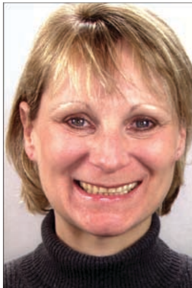
Figure 11: This patient presented for orthodontic smile improvement. Her smile was characterized by diminished incisor display, tooth shade issues, and loss of crown height.