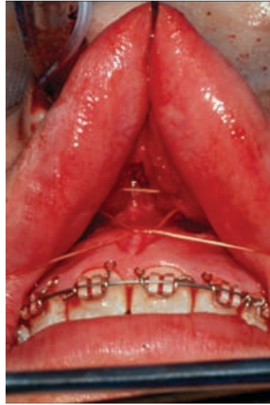
Figure 6: The V-Y cheiloplasty goes beyond the alar cinch by the use of vertical orientation of the incisions and closure, lengthening the resting length and demobilizing the upper lip.

The smile style is important because of the difference in how much the upper and lower dentitions are demonstrated upon smiling. For example, the commissure smile may show more tooth posteriorly than anteriorly; and, in the orthodontic case, may require some incisor extrusion; and, in the restorative case, may allow some leeway as far as gingival margin placement.