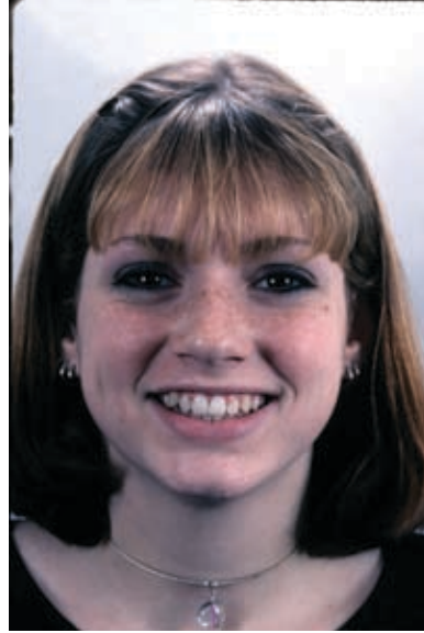
Figure 2: In addition to closing the diastema, the plan was directed to increase anterior tooth display. The resulting smile display was much more youthful in appearance.

Let's use an actual patient as an example. The patient shown in Figure 1 was brought in by her parents for treatment of what was obvious to them—the maxillary midline diastema.