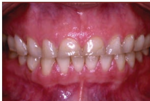
Figure 12: The root cause of her smile problem was one of severe dental attrition.

her dentist proceeded to minimally prepare his veneers. By adding incisor length he not only added support to the upper lip, but also some eversion to the lower lip, improving lip fullness. This patient's final smile is shown in Figure 13 and the increased lip support in Figure 14.