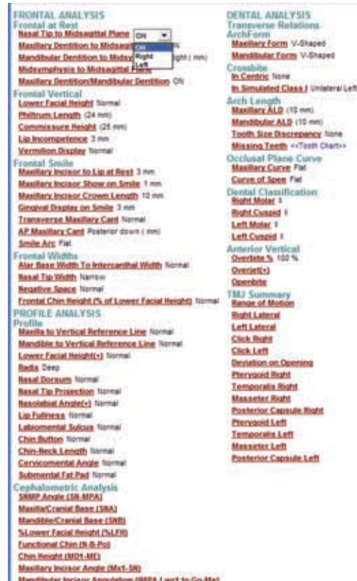
Figure 4: Computer databasing programs facilitate the clinical examination and store the information we measure in a retrievable and systematically usable format.

ships of hard tissues. Please share with us what you believe should be the new standard of documentation and treatment planning in orthodontics.