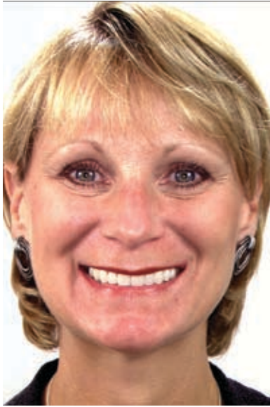
Figure 13: Restoration with veneers included appropriate crown thickness and length resulting in more incisor display, better tooth color, and a consonant smile arc.