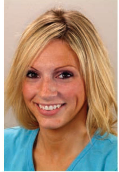
Figure 3: The smile 10 years after completion of treatment

These parents (and many other parents of adolescents) are aware of what their own orthodontic experiences were like, and think only about "crooked teeth." On clinical examination, we noted that the patient showed about 3 mm of upper incisor at rest (5 to 6 mm is desirable in that age group) and 8 mm of upper incisor display on smile. Crown height was 10 mm. We differentially placed her brackets and adjusted the mechanics in such a way that the upper incisors were brought down and the anterior maxilla were encouraged to develop more vertically. The resulting smile display was much more appropriately youthful in appearance (Fig 2). A photograph of the patient 10 years later (Fig 3) demonstrates how this expansion of orthodontic vision has contributed to the beauty of her facial and smile appearance into adulthood.