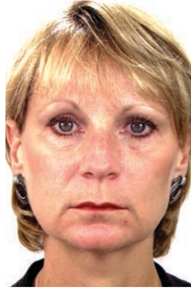
Figure 14: The length and soft tissue support resulted in improved lip support—a youthful enhancement of resting lip posture.

care at its finest. What are some of the secrets to your success?