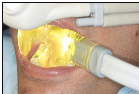
Figure 1. Amber light and retraction/suction improve the use of photosensitive materials.

Visualization systems (ie, Isolite, Isolite Systems, Santa Barbara, CA) that deliver proper lighting combined with an ergonomic approach have since been combined with methods designed to improve moisture control and tissue retraction (Figures 1 and 2). The Isolite uses white fiber-optic light to illuminate the intraoral cavity, and it can be filtered for use with light-sensitive adhesive bonding